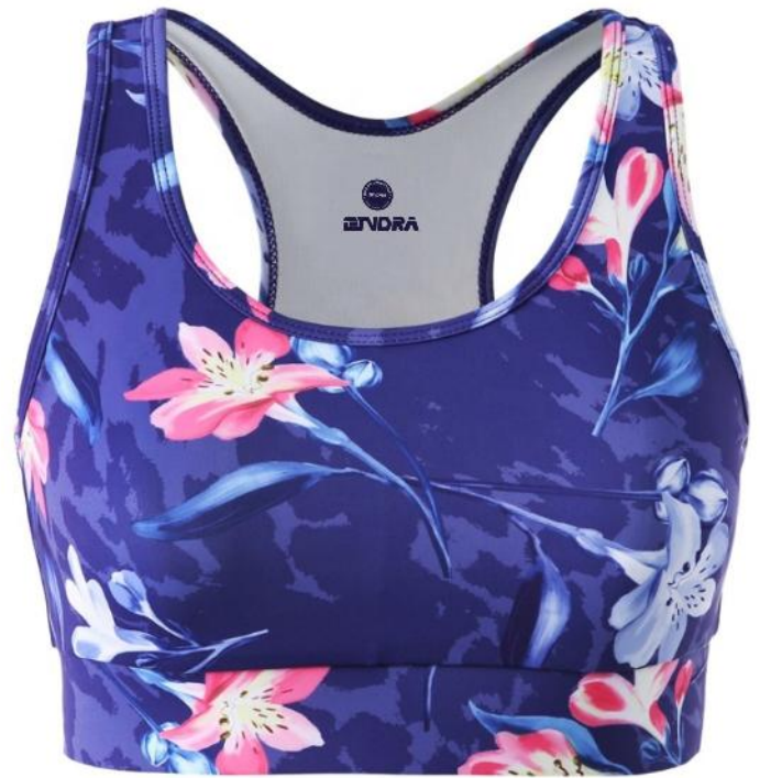
Art #: OI-FW-1403