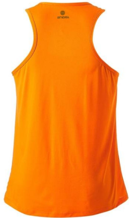
Art #: OI-FW-1301