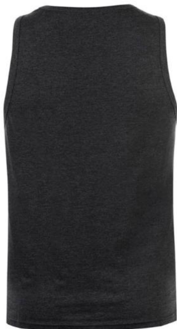
Art #: OI-FW-1303