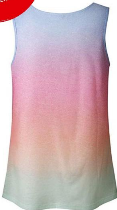
Art #: OI-FW-1302

SIZE COLOR MATERIAL MOQ ON CUSTOMER DEMAND