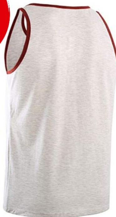
Art #: OI-FW-1304

SIZE COLOR MATERIAL MOQ ON CUSTOMER DEMAND