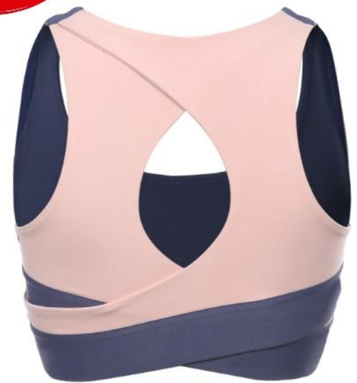
Art #: OI-FW-1404