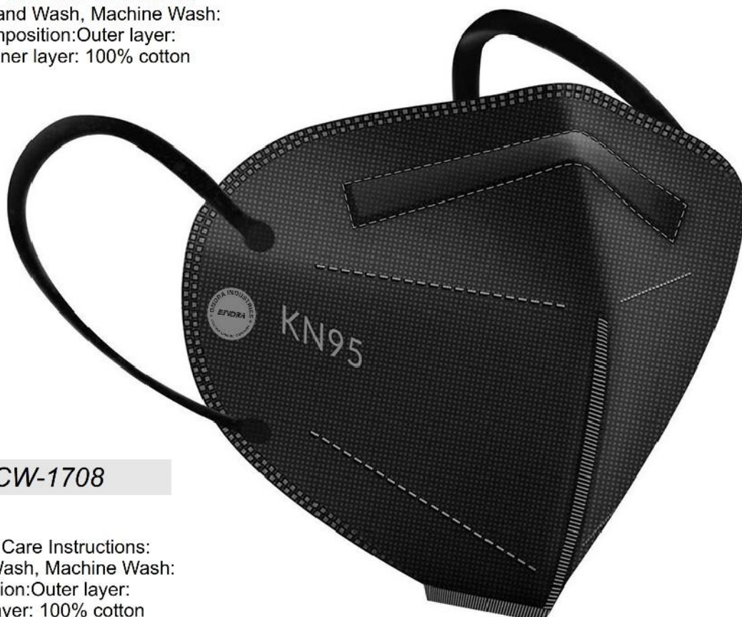
Art #: OI-CW-1708

Overall Fit: True to Size Care Instructions: Do Not Bleach, Hand Wash, Machine Wash: Cold Material Composition: Outer layer: 100% polyester Inner layer: 100% cotton