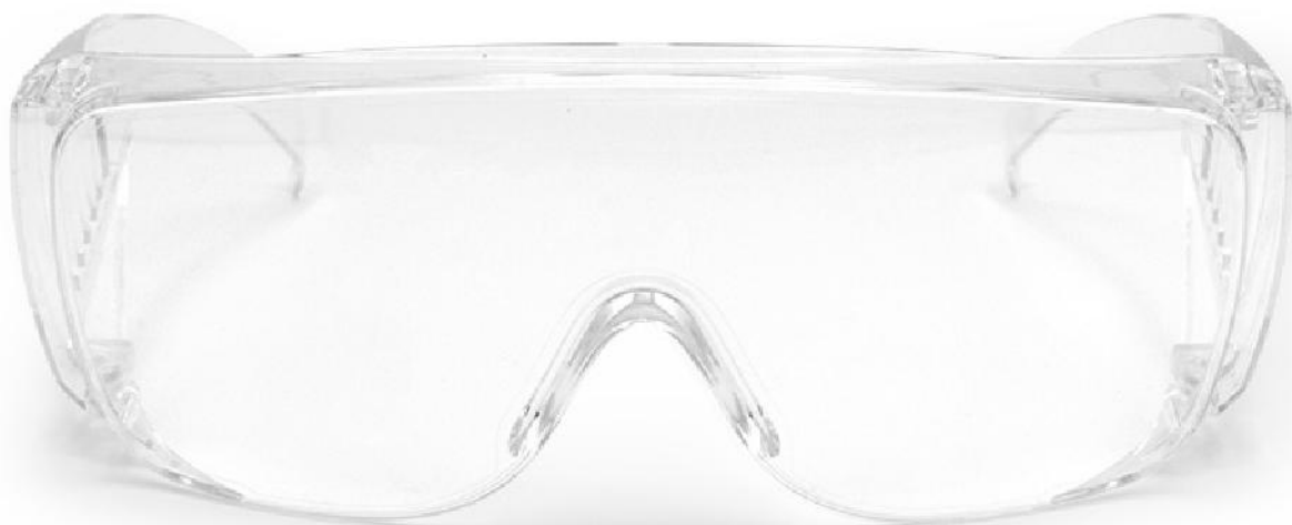
Art #: OI-SW-2403