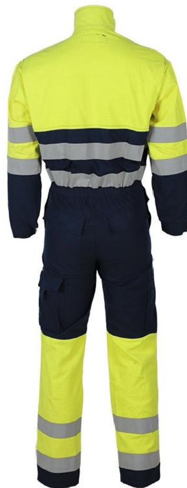
Art #: OI-SW-2003