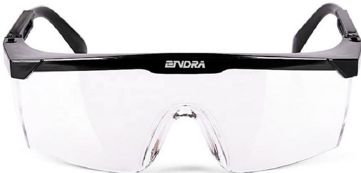
Art #: OI-SW-2402