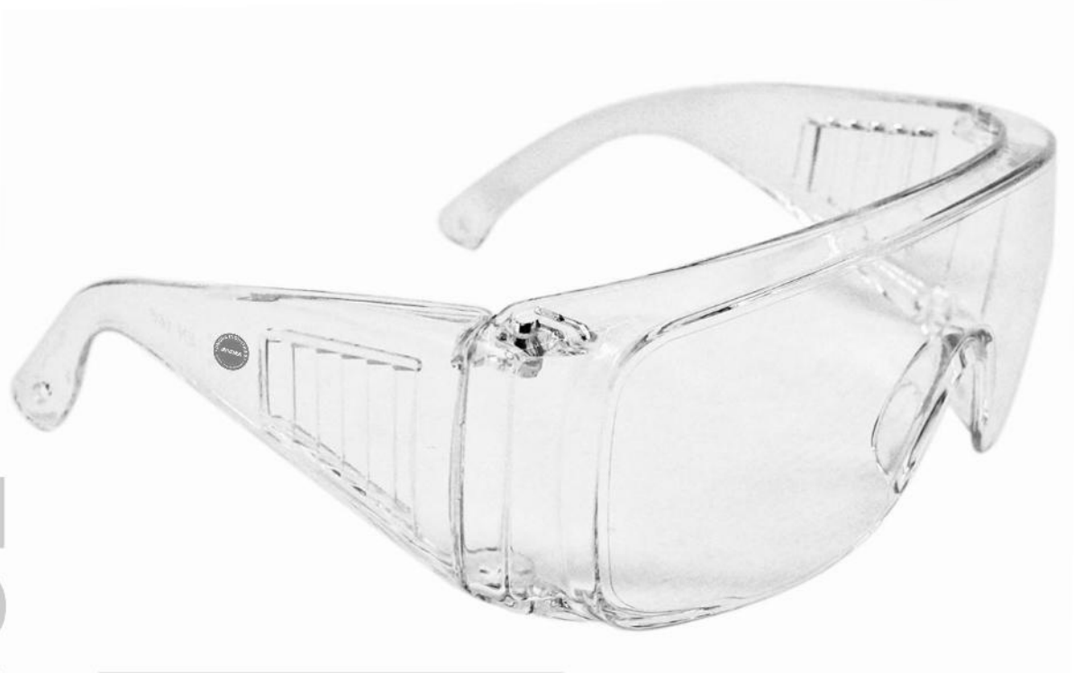
Art #: OI-SW-2401