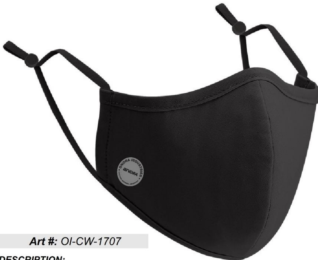
Art #: OI-CW-1707