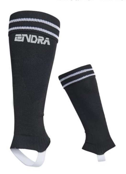
Art #: OI-TW-1804 DESCRIPTION:

Quality: 70% polypropylene, 21% polyamide, 7% cotton, 2% elastane Moisture management fabric Knee high rise Airflow mesh for ventilation Padded ankle protection