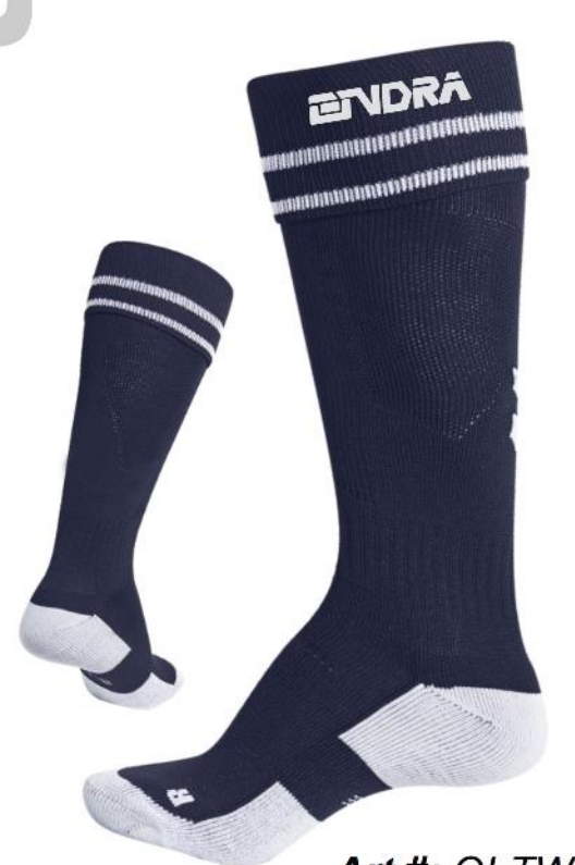
Art #: OI-TW-1803