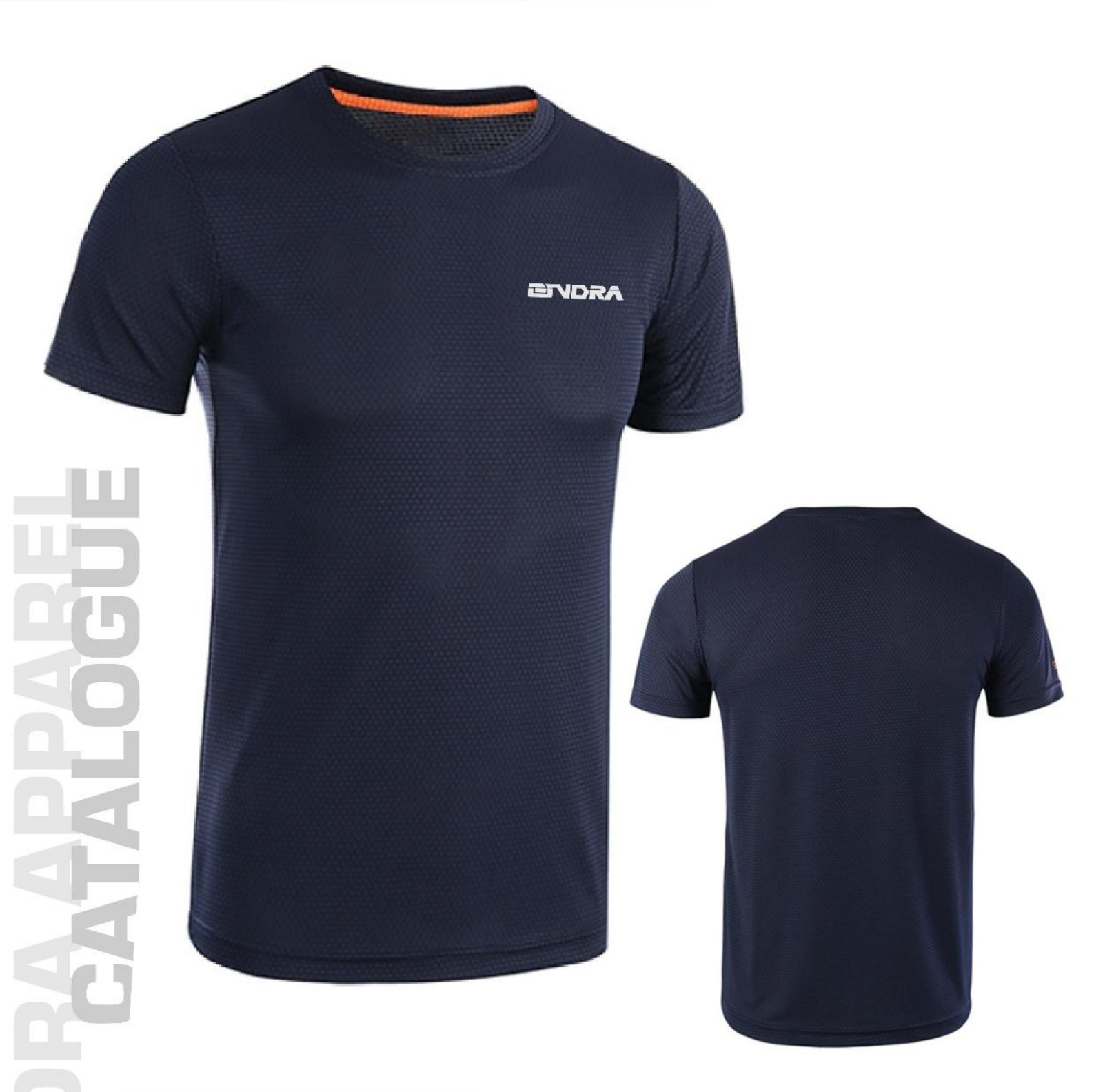
Art #: OI-SW-2101