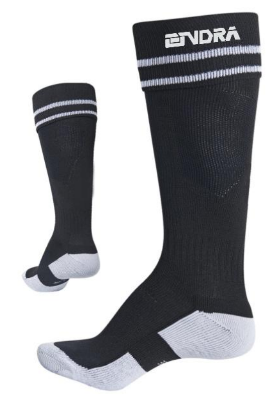
Art #: OI-TW-1801