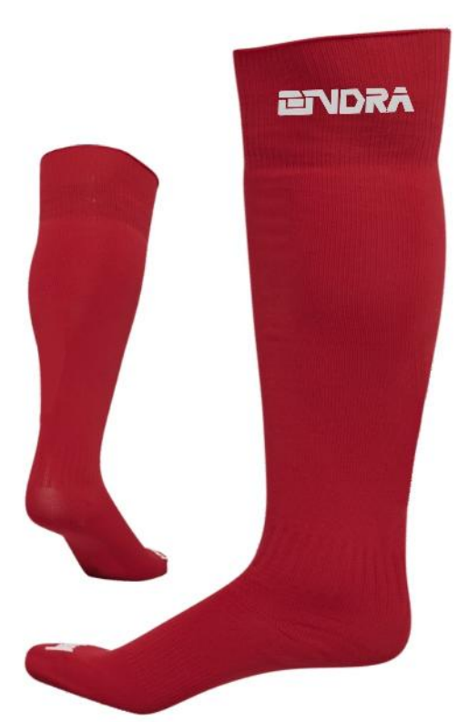
Art #: OI-TW-1802